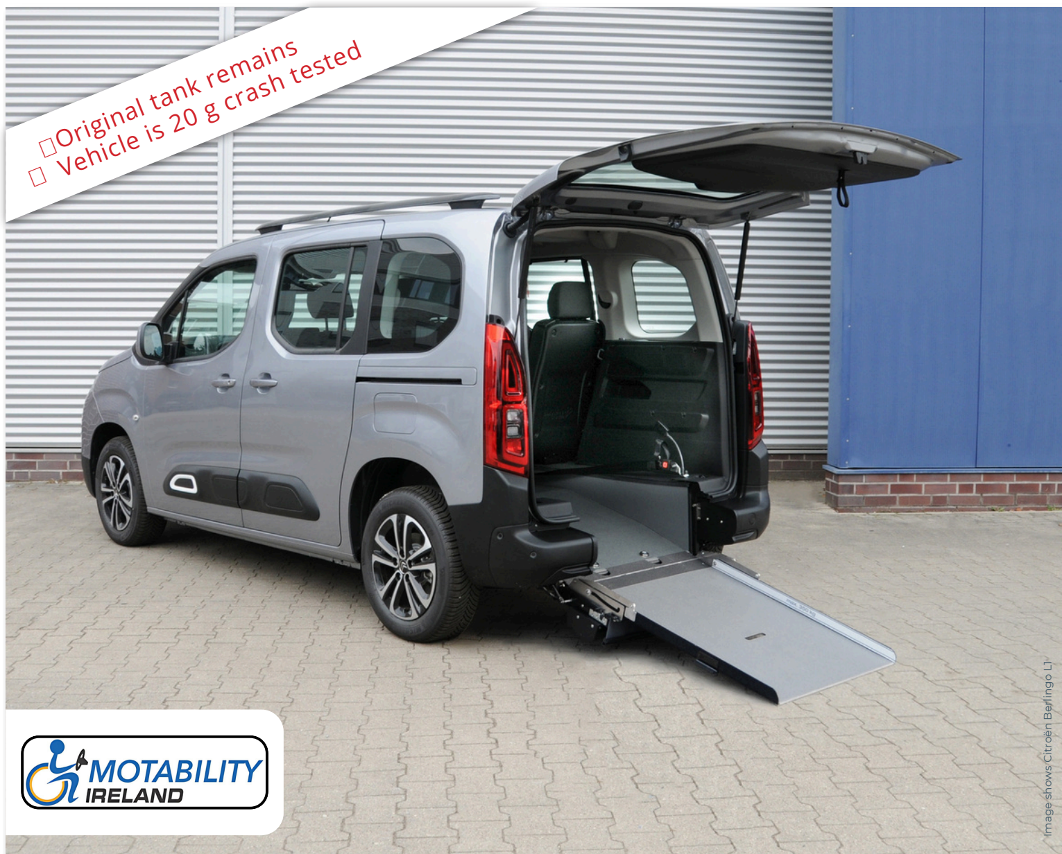
Image shows Citroën Berlingo L1