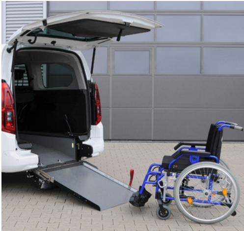
With the unfolded ramp the vehicle can be accessed comfortably with a wheelchair.