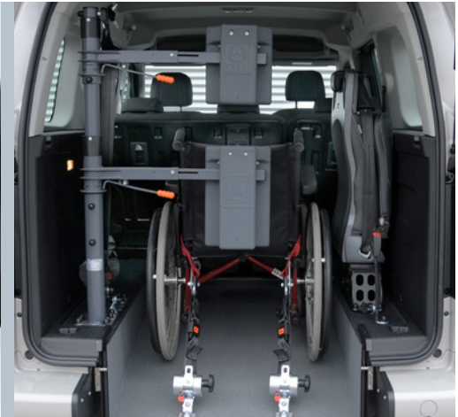
The head & backrest FUTURE SAFE (optional) provides additional safety.