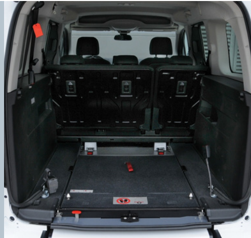
Optional EASYFLEX ramp folded flat allows full use of the luggage area.