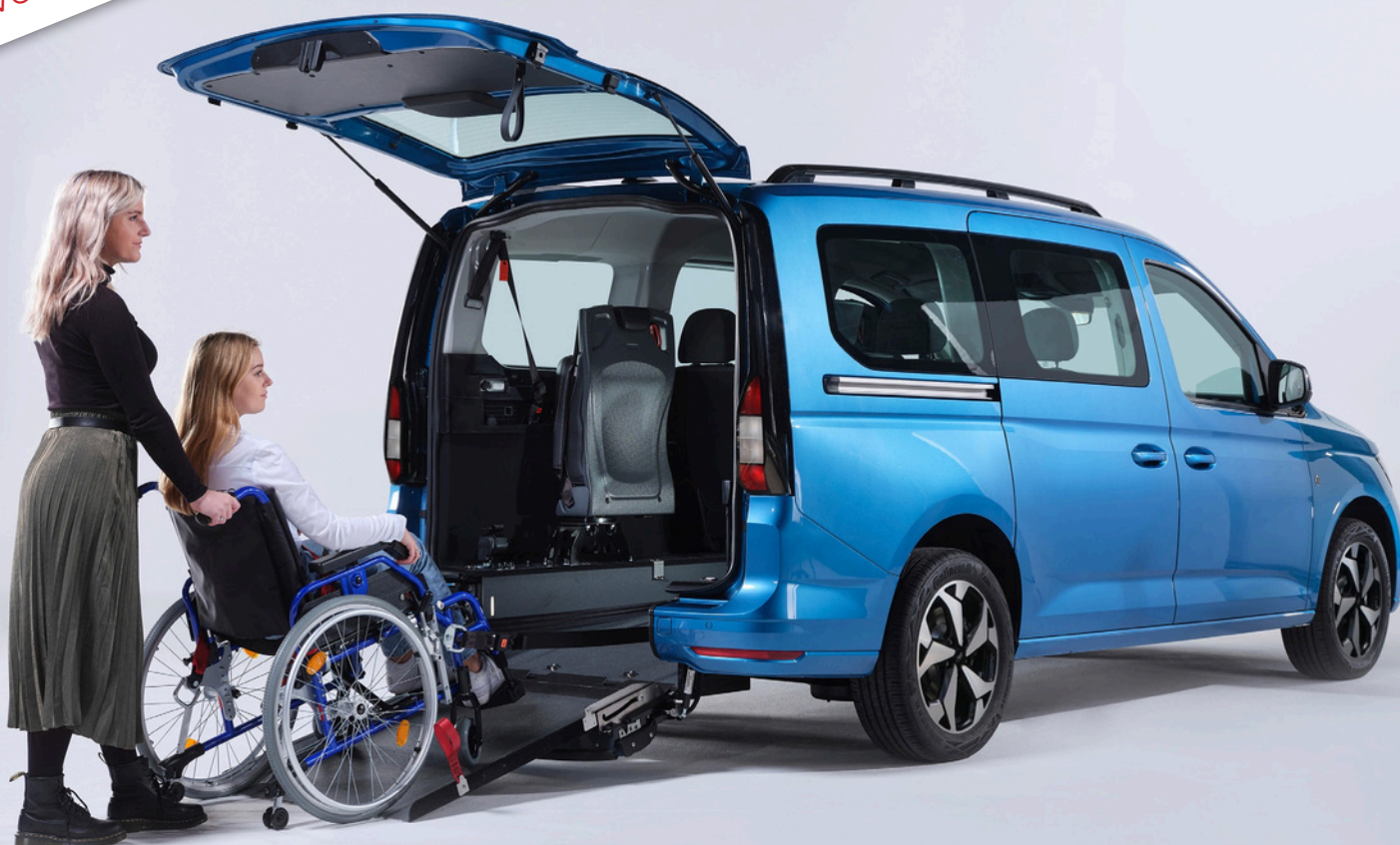
Image shows Ford Grand Tourneo Connect