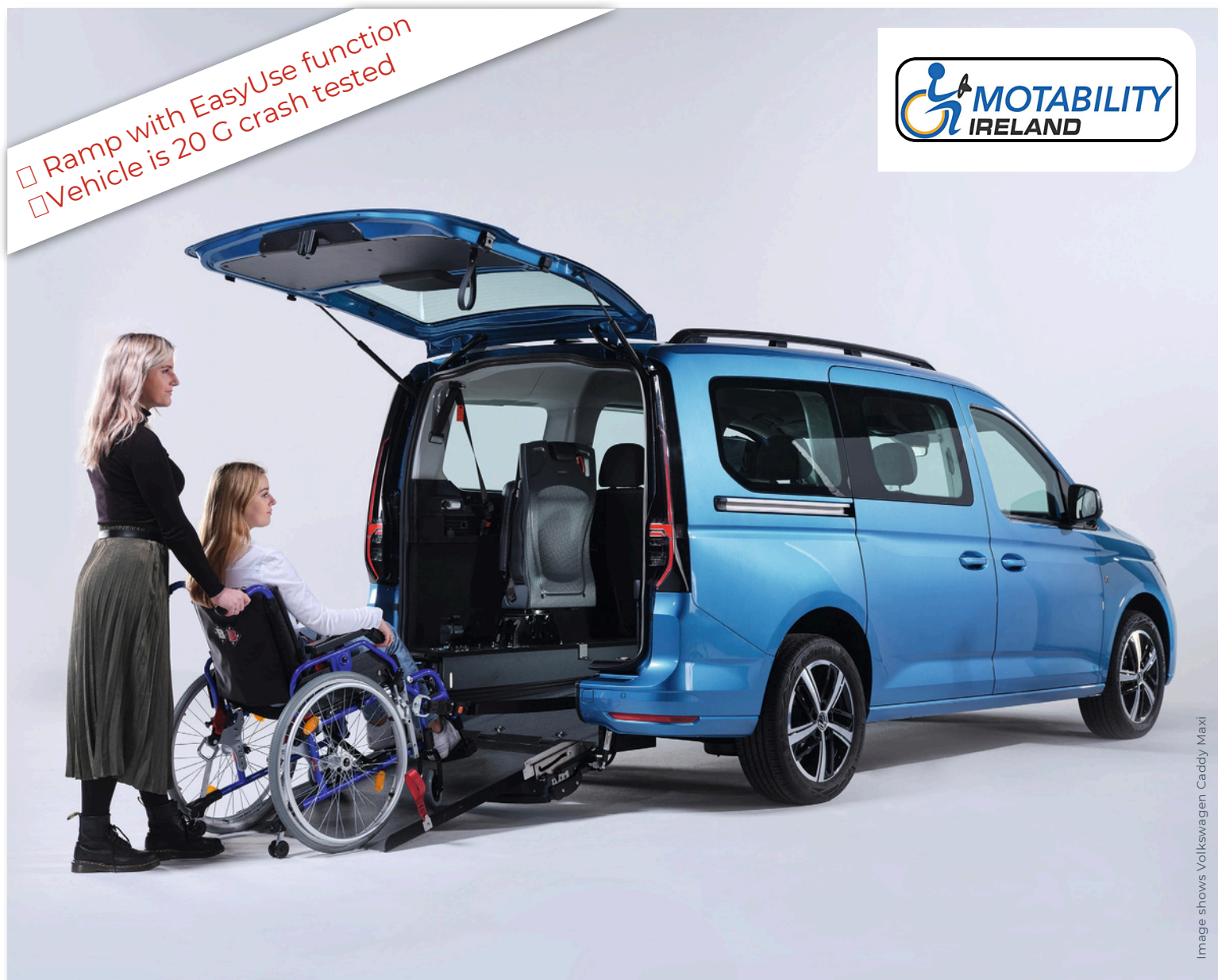
Image shows Volkswagen Caddy Maxi